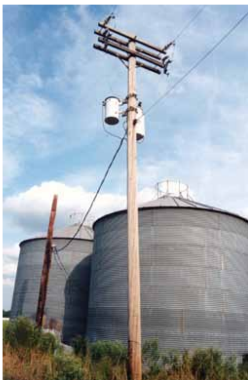
Electrocutation is the second leading cause of death for utility and construction workers. With so many people heading outdoors in the spring, power line awareness is even more crucial at this time of year.