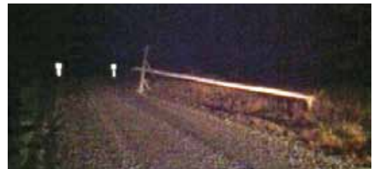
One of nine poles down on Kiowa Road, just north of 160 Highway.

As always, I look forward to hearing feedback on this article or ideas for future articles. I can be reached at wworthy@wavewls.com .