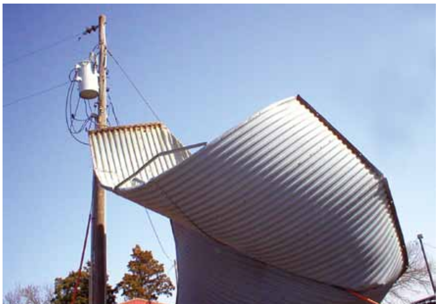
The storm brought scenes like this one where a steel and tin hog barn was wrapped around a single phase pole and guy wire.