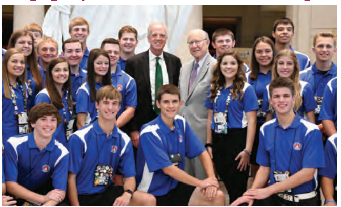
During the Electric Cooperative Youth Tour to Washington, D.C., students meet with our elected officials. Next year's tour will be June 13-20, 2019.

Twin Valley Electric Cooperative, Inc. will send one high school junior to the Electric Cooperative Youth Tour in Washington, D.C., and one to the Cooperative Youth Leadership Camp in Steamboat Springs, Colorado.