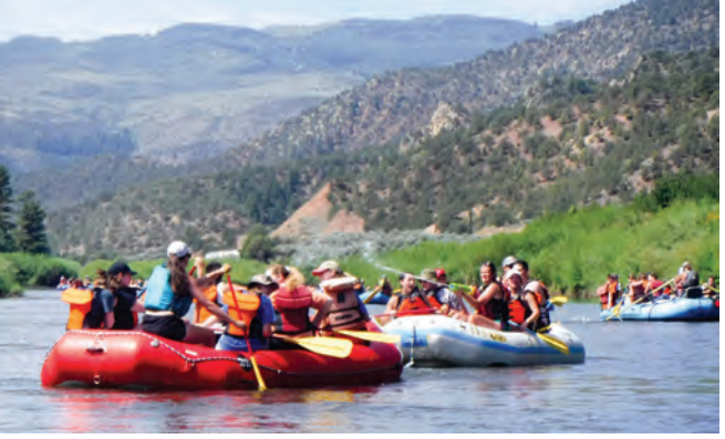
Each year, campers go rafting during Cooperative Youth Leadership Camp in Steamboat Springs, Colorado. Next year's camp is scheduled for July 12-18, 2019.

information provided by Twin Valley regarding electric cooperatives. There will also be a SHORT INTERVIEW ON FEB. 1, AT 3 P.M. to pick the winners. To apply please complete, sign and return the application below to Twin Valley, 1511 14,000 Rd, P.O. Box 368, Altamont, KS, 67330 BY JAN. 18.