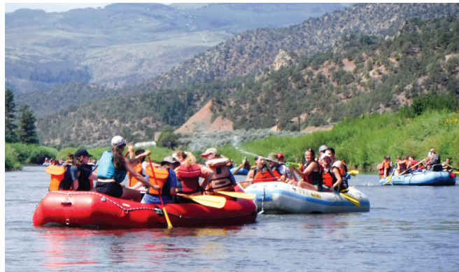
Each year, campers go rafting during Cooperative Youth Leadership Camp in Steamboat Springs, Colorado. Next year's camp is scheduled for July 10-16, 2020.

Applicants will be expected to study and take a quiz over