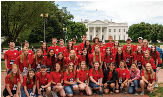
During the Electric Cooperative Youth Tour to Washington, D.C., students meet with our elected officials. Next year's tour will be June 18-25, 2020.

Twin Valley Electric Cooperative, Inc. will send one high school junior to the Electric Cooperative Youth Tour in Washington, D.C., and one to the Cooperative Youth Leadership Camp in Steamboat Springs, Colorado.