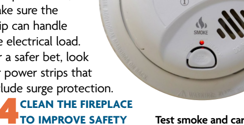
Test smoke and carbon monoxide detectors once a month and clean them to ensure the sensors are clear of dirt and debris.

Twin Valley wants you and your family to stay safe during the winter season.