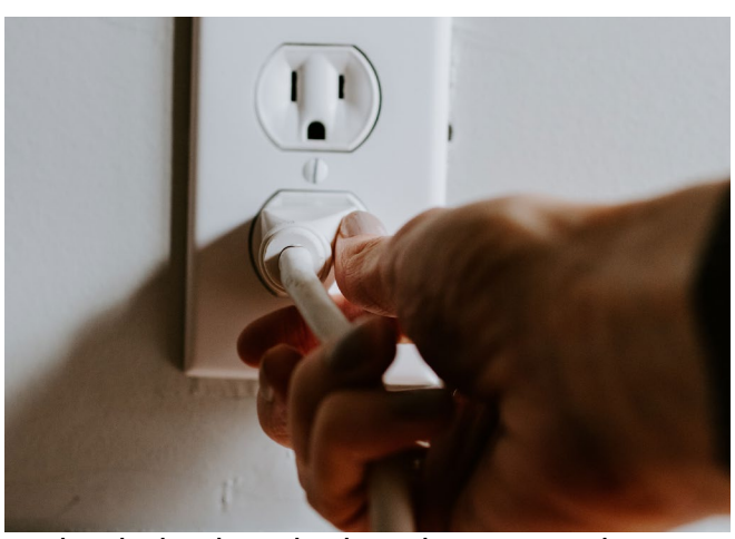
Avoid overloading electrical outlets and power strips. When overloaded with electrical items, outlets and power strips can overheat and catch fire.