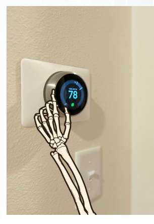
daily routine and adjusting the temperature

Illuminate your lair with energy efficient lighting. LED BULBS use 75% less energy and last 25 times longer than incandescent lightbulbs. Make the switch to reduce energy used for lighting.