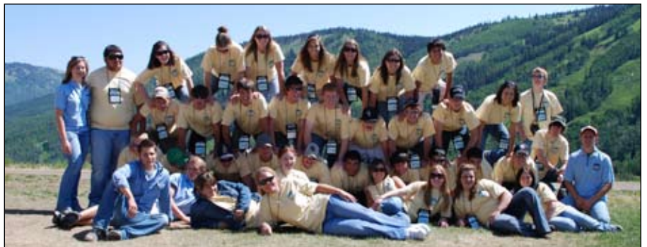
The Kansas and Oklahoma campers build a human pyramid atop Mt. Werner in Steamboat Springs, CO.