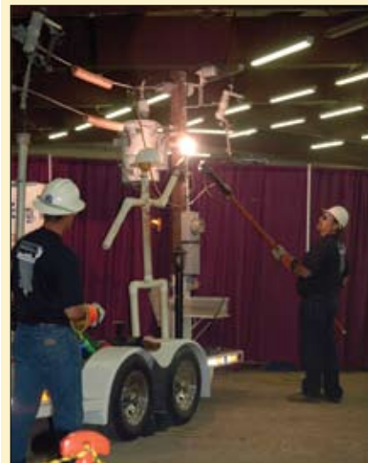
Cooperative employees present the High Line Safety Demonstration at the 2007 State Fair.

For the second year, the Kansas electric cooperatives and Touchstone Energy cooperatives of Kansas are co-sponsoring a high-voltage line safety demonstration.