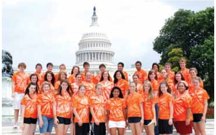
Students from Kansas join more than 1,500 youth in Washington, D.C, this year's Youth Tour is scheduled for June 9-16, 2011.

To apply please complete, sign and return the application below to Twin Valley, PO Box 368, Altamont, KS 67330.