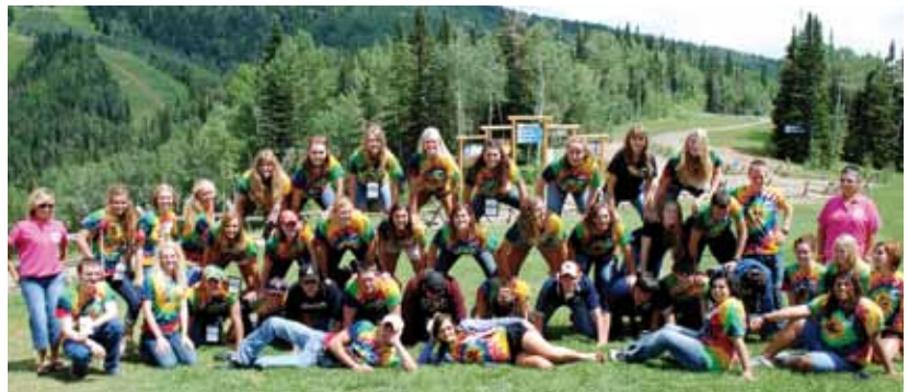
Kansas delegates will attend Cooperative Youth Leadership Camp July 9-15, 2011.