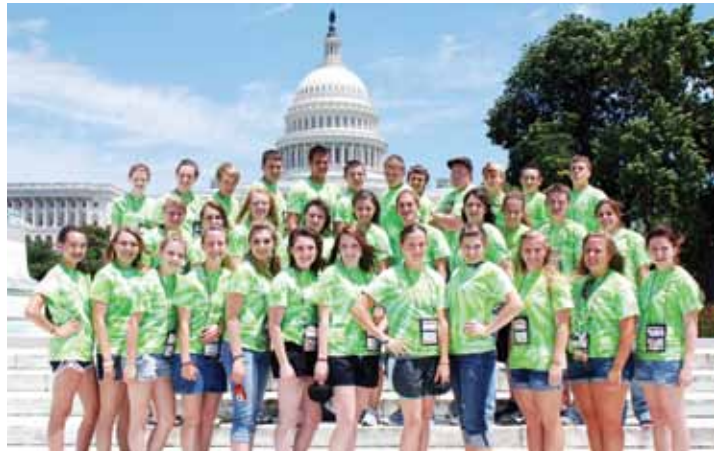
Students from Kansas join more than 1,500 youth in Washington, D.C. This year's Youth Tour is scheduled for June 14-21, 2012.

To apply please complete, sign and return the application below to Twin Valley, P.O. Box 368, Altamont, KS 67330.